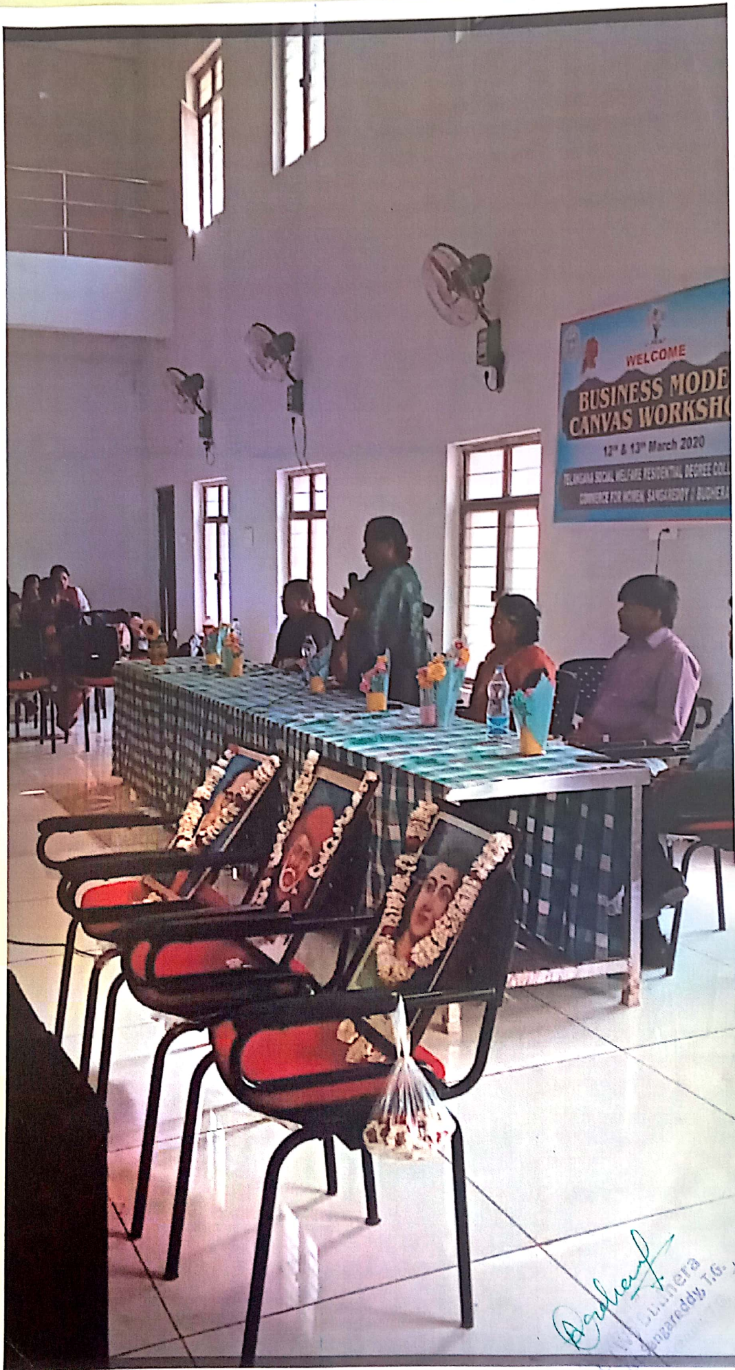
BUSINESS MODEL CANVAS WORKSHOP