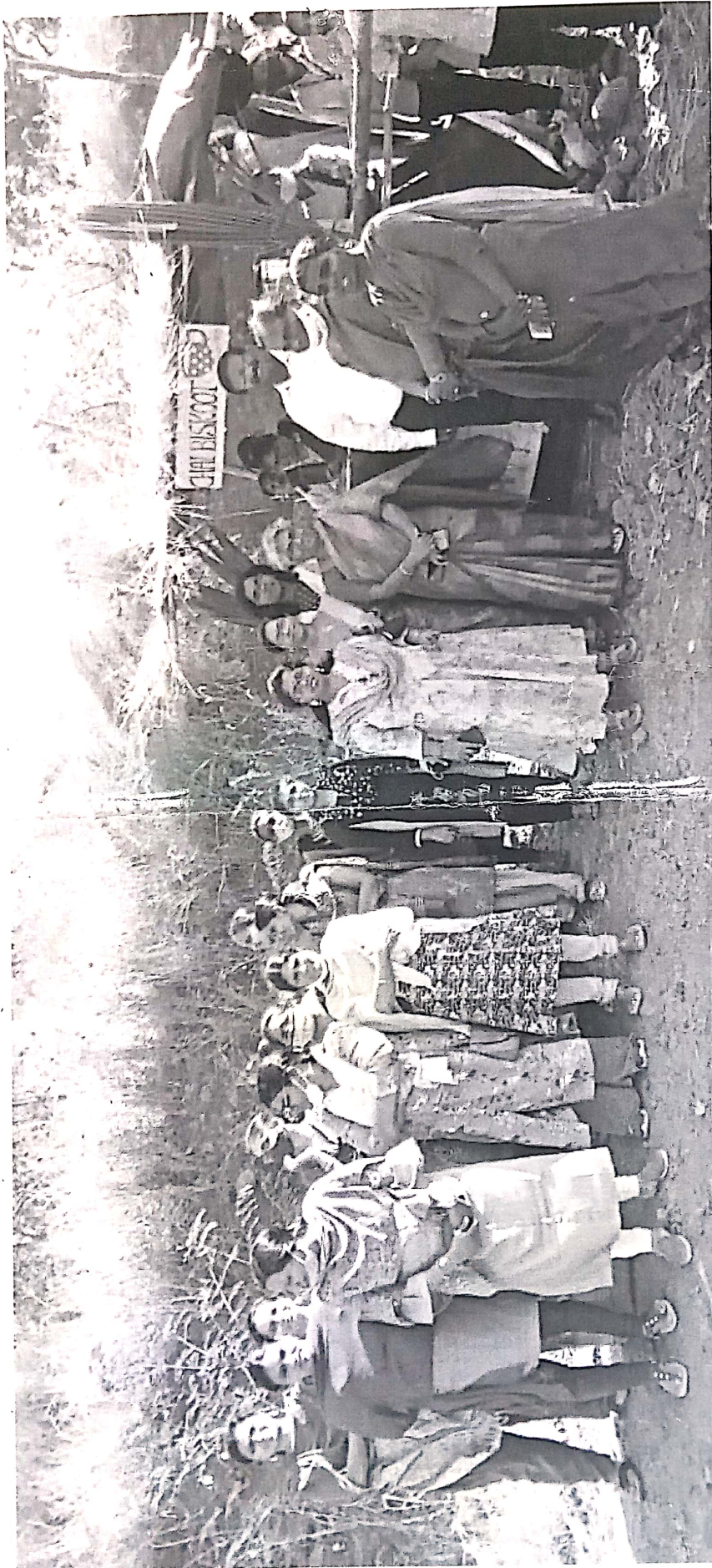
Principals PRINCIPAL (SWRDC (W) SANGAREDDY) Sangareddy Dist.